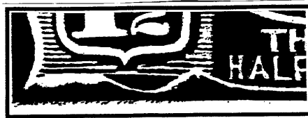
17L58 State 3 Flaws