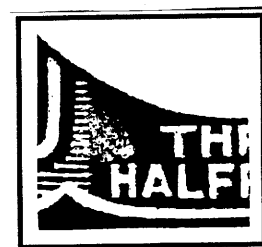
17L58 Flaw (a)