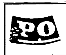
17L58 Flaw (b)