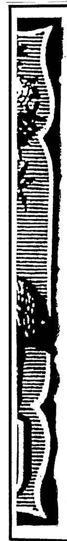
UCV C25 State 2