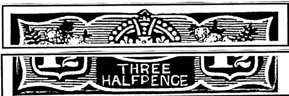
UCV F71 Flaws (a) and (b)

Note: Flaws (a) and (b) are similar to many clichés in green printings, however the combination of top and bottom frame markings, along with cliché no 55 separates this from other clichés.